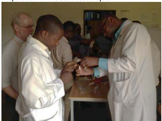
Preparation of the 'trotters' for skills