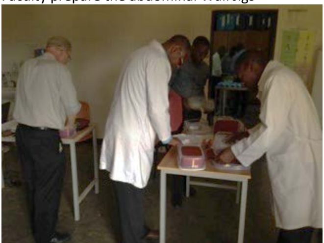
Preparation of the Sebaceous Cysts