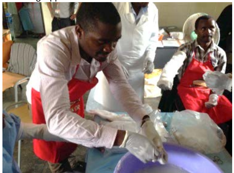
Candidates complete feedback for BSSC